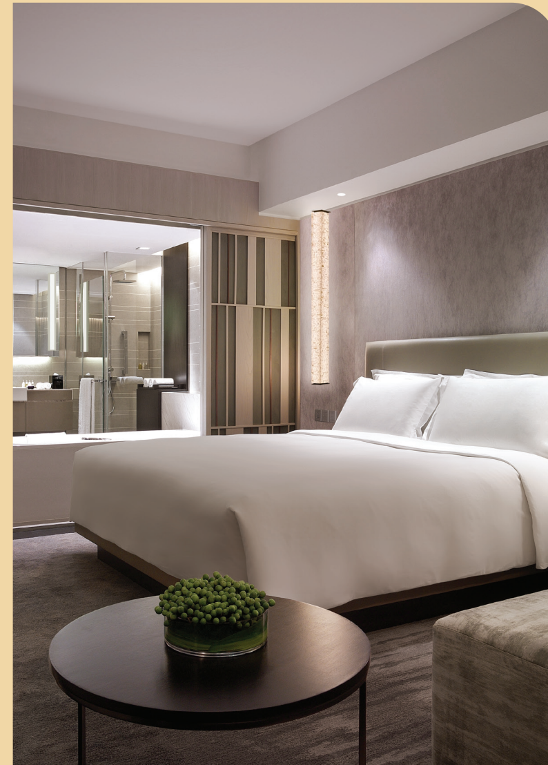
Residence Club Deluxe Room

Breakfast for 2 adults and 2 children (11 years and below)