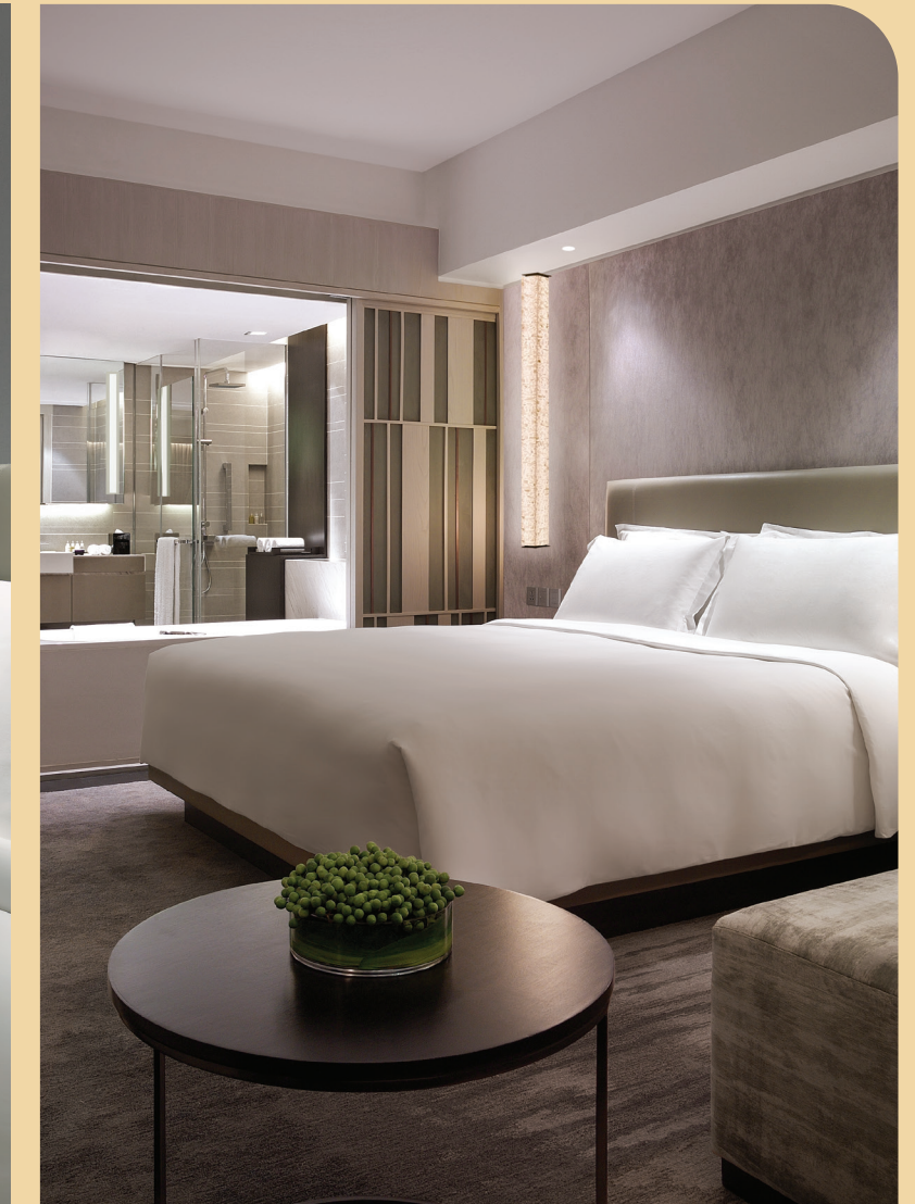
Residence Club Deluxe Room

Breakfast for 2 adults and 2 children (11 years and below)